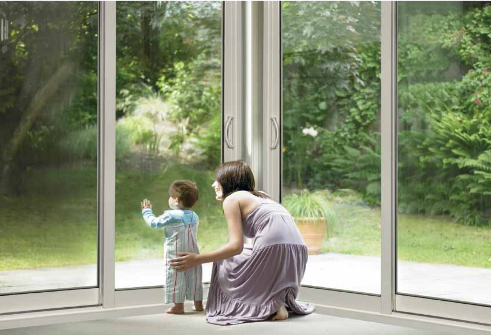
Single Slider (OX/XO)