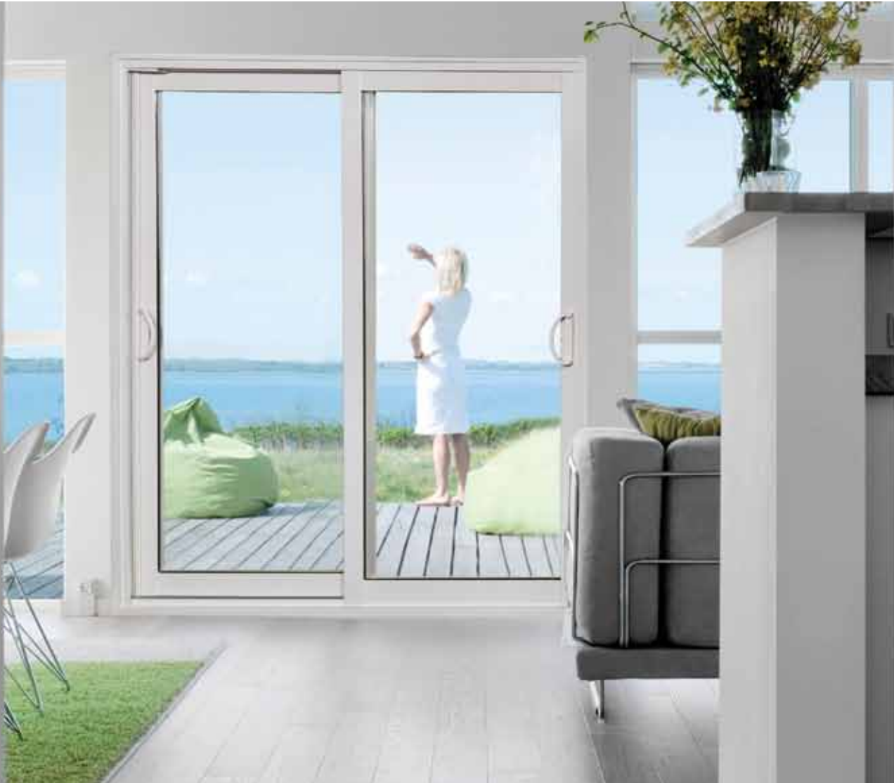
Double Slider (XX)